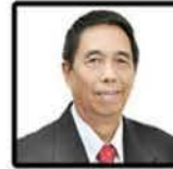
PDG. TEODORO LOCSON COUNCIL ON LEGISLATION DISTRICT REPRESENTATIVE